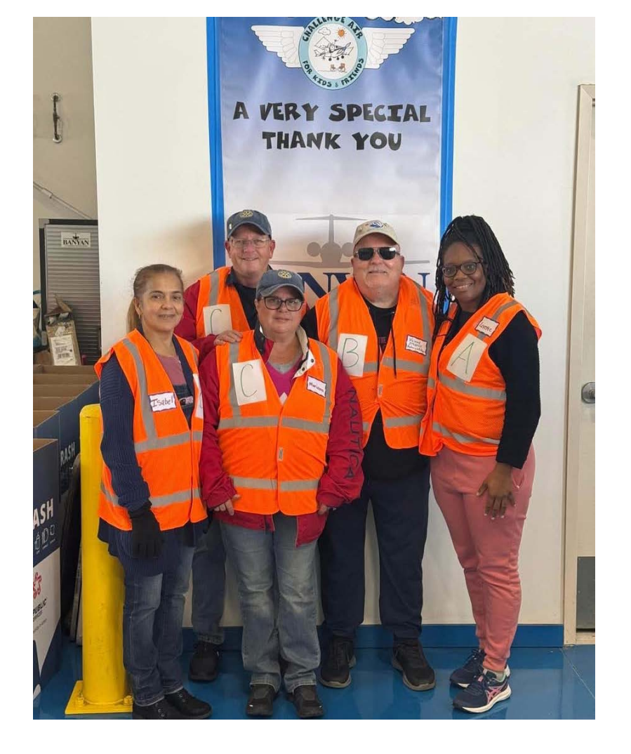
Pompano Beach Rotary Club Volunteers

For videos and more pictures from Challenge Air Fly Day, visit our <u>Facebook</u> and <u>Instagram</u> pages. Challenge Air will be posting their pictures on <u>flickr</u>.